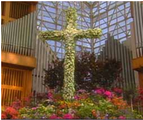
CROSS continued from page 1