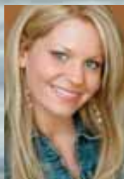
Candace Cameron Bure

Candace Cameron Bure , former child star from "Full House" will share about her successful career, her marriage to professional hockey star Valerie Bure , and her faith. Message by Robert A. Schuller .