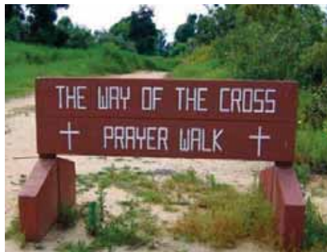
During the retreat, 40 attendees walked "The Way of the Cross," following in spirit the last moments leading up to Christ's final sacrifice.

"The balance of teaching and experience were excellent. The individual time and small group