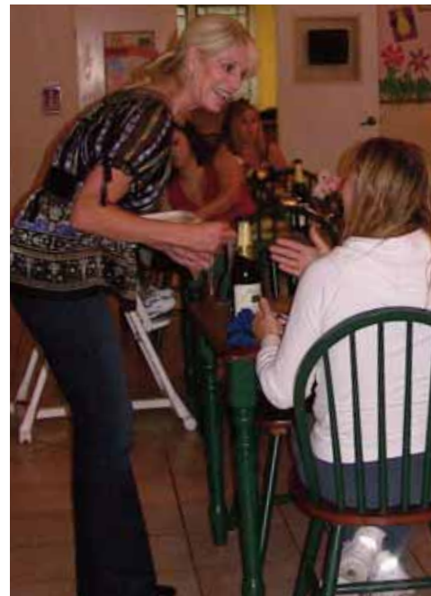
Donna and Crystal Cathedral volunteers encouraged often-overlooked mothers that they are loved.

Finally, Mother's Day was celebrated with the ESL (English as a Second Language) students who come faithfully each Saturday for instruction. All enjoyed a delicious potluck luncheon and gifts