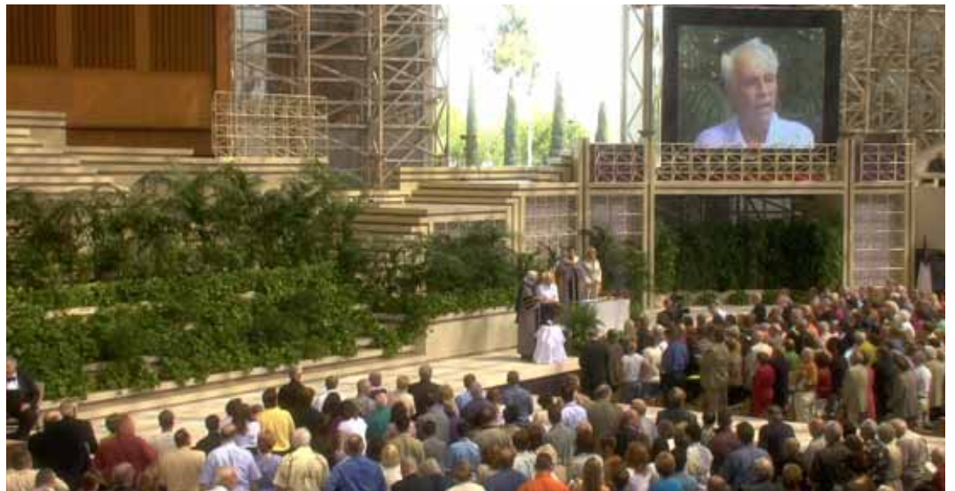
After the amazing Sunday where Robert "Evel" Knievel shared his testimony, followed by his and hundreds of others' baptisms, we heard from thousands of people around the world.