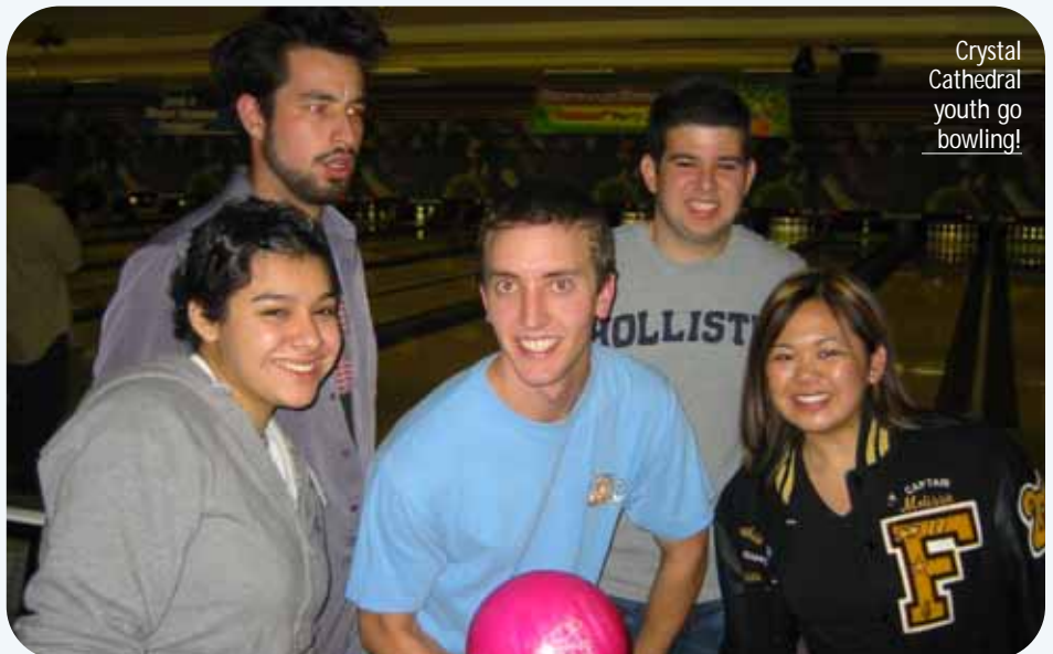
Crystal Cathedral youth go bowling!

Quiet Room: In the Tower Lobby, watch the service with your child.