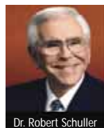
Dr. Robert Schuller