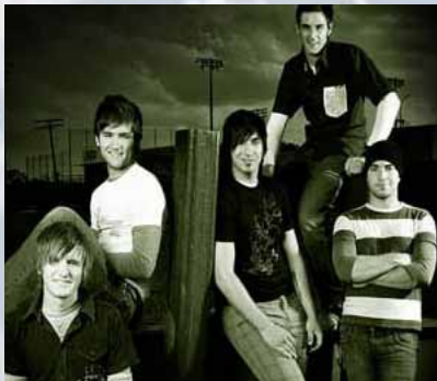
Rush of Fools

Be inspired by this popular and poignant voice in contemporary Christian music, singer/songwriter Matthew West .