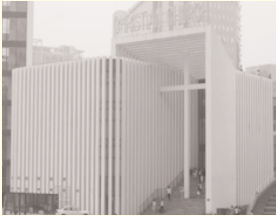
A general view of Beijing Haidian Christian Church built in 2007