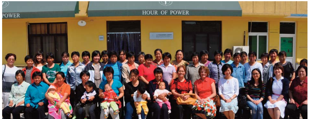
The local community at the opening of the Daxing County Hour of Power Disabled Orphan’s Training and Rehabilitation Center. This center serves the 350 disabled orphans and their foster families in this farming community. The Canadian and Dutch ministries helped pay for the building renovations, and equipment needed to perform essential physical occupational therapy exercises for the children with cerebral palsy so their muscles don’t harden and lock before the age of seven.

Thanks to a special donation by Hour of Power supporters, two busloads of disabled orphans, foster parents, and social workers from the Daxing County Orphanage were given a special day of