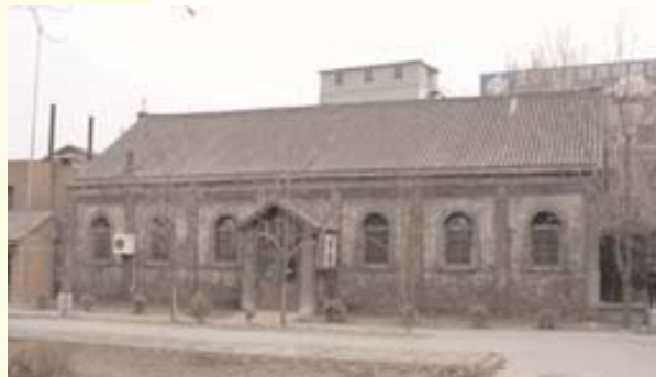
The old Beijing Haidian Christian Church built in 1933

God has abundantly blessed Haidian Church with significant growth in the last ten years, increasing atten-