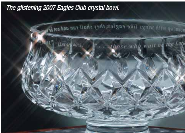
The glistening 2007 Eagles Club crystal bowl.

"Those who wait upon the Lord shall renew their strength. They shall mount up on wings as eagles. They shall run and not be weary. They shall walk and not faint."