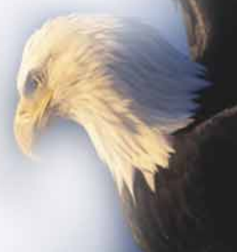
ROBERT H. SCHULLER

“Now abide faith, hope and love, and the greatest is love” (I Corinthians 13:13).