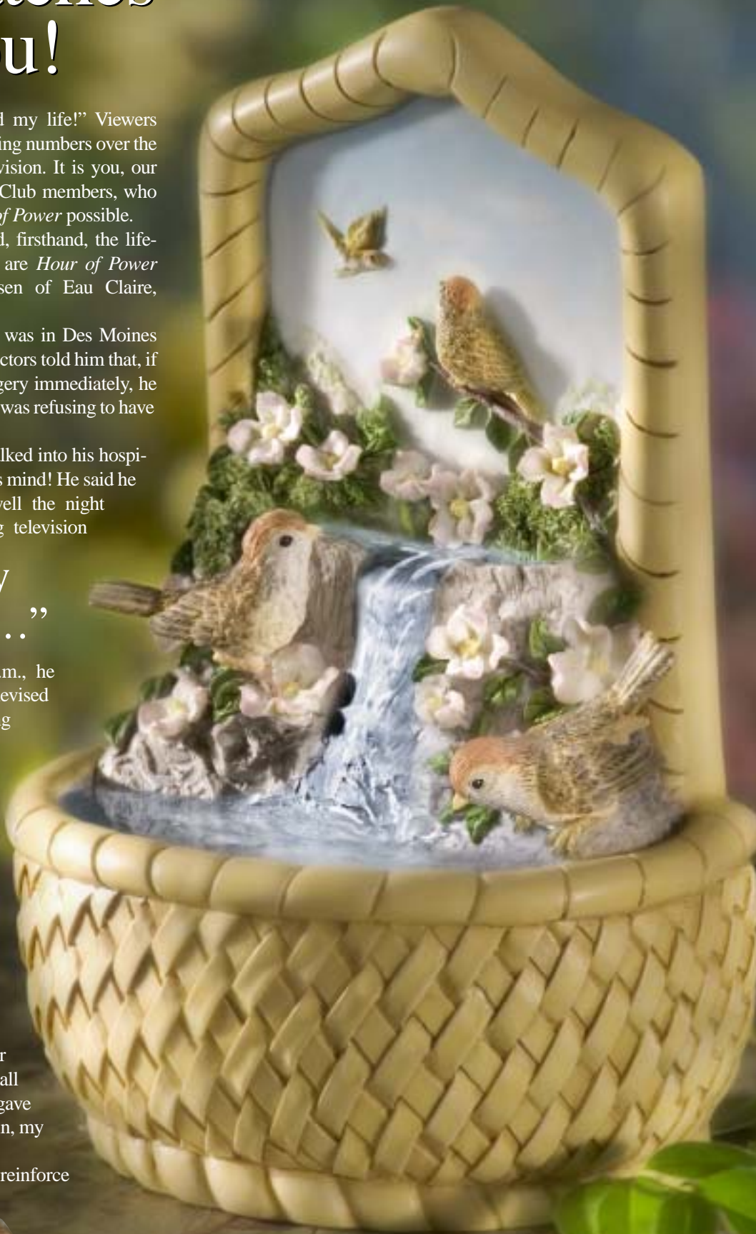
Nearly 9" tall, the beautifully crafted 2007 Sparrows Club Fountain is the perfect addition to that favorite corner of your home.