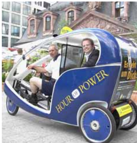
These mini-taxis in Germany will bring the good news of the Hour of Power to curious passersby.