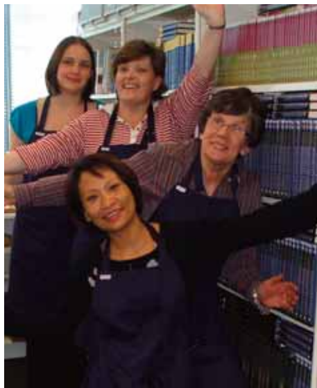
Our New Zealand staff in their new headquarters.