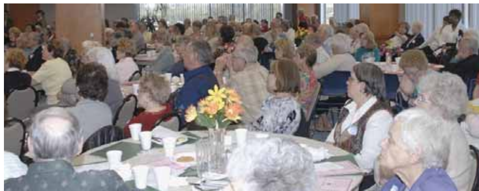
It was a full house at the 50+ Celebration in April.