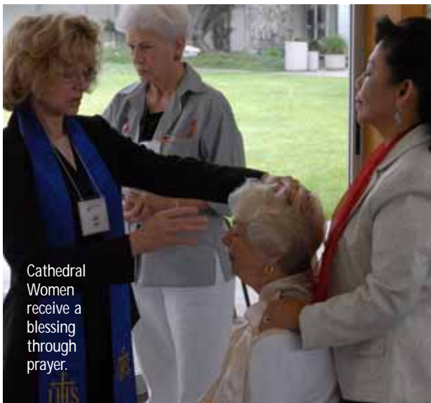
Cathedral Women receive a blessing through prayer.