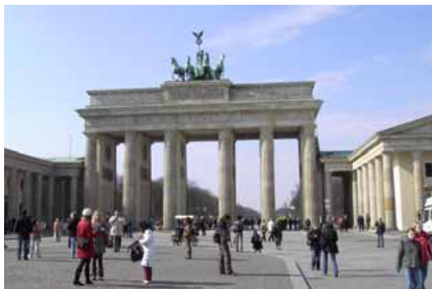
The Brandenburg Gate in Berlin, Germany, reminds us all that we can tear down our own walls to find freedom in Christ.

Our experience here has reminded us of what a huge world this is with so many hurting people who need to hear the positive message of Christ's love!