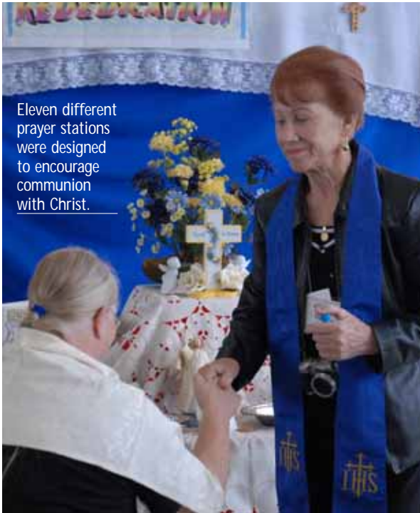
Eleven different prayer stations were designed to encourage communion with Christ.