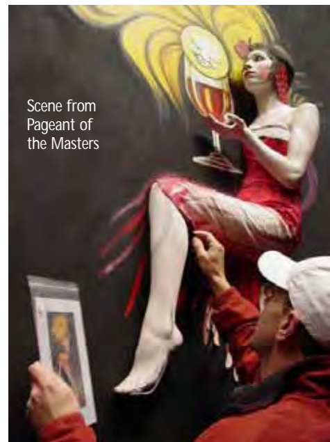
Scene from Pageant of the Masters

Every Sunday, 11 AM in FLC-470, mature singles do their very best to portray love to each other and to every new person who enters the doorway, and share the wisdom of the Word as applied to everyday living. Every Tuesday, 7 PM in FLC-3, they do the same during "Tuesdays Together." On Sunday mornings and Tuesday evenings at the Crystal Cathedral, find some of the best people in