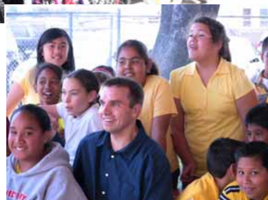
Top: Cool bikes for exceptional kids.