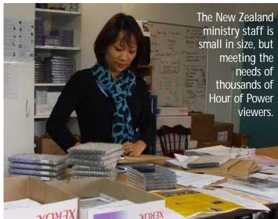
The New Zealand ministry staff is small in size, but meeting the needs of thousands of Hour of Power viewers.