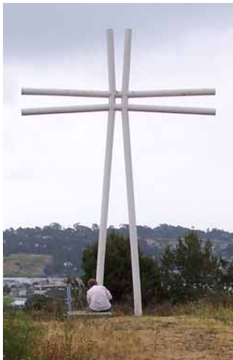
Learning continued from page 4

formation retreat, "Praying the Psalms with Jesus," which filled all 40 available spaces and had a waiting list. Here are some of the comments that were shared: