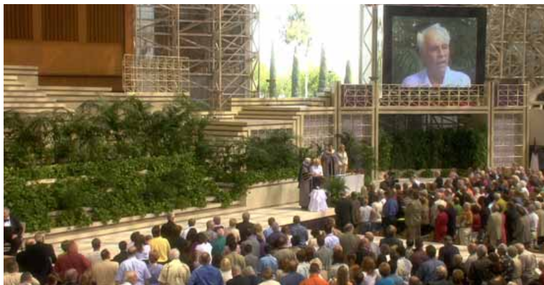
After the amazing Sunday where Robert "Evel" Knievel shared his testimony, followed by his and hundreds of others' baptisms, we heard from thousands of people around the world.