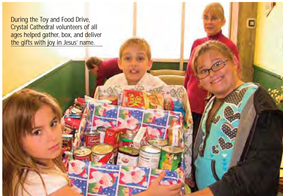
During the Toy and Food Drive, Crystal Cathedral volunteers of all ages helped gather, box, and deliver the gifts with joy in Jesus' name.