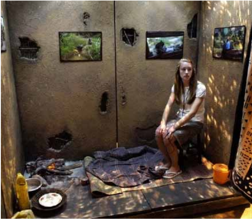
During your journey through "Step Into Africa," you will travel interactively through dusty villages, and ramshackle homes.