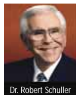
Dr. Robert Schuller