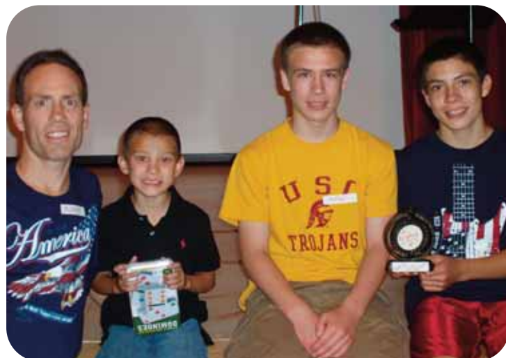
Congratulations Team Raspberry, the winning Family Fun Night team in June!