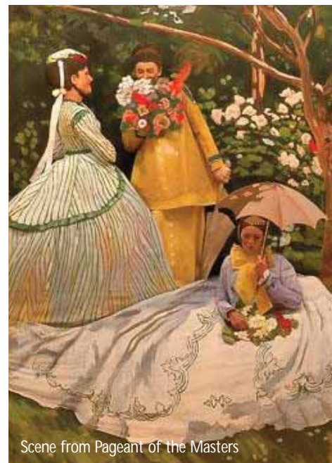
Scene from Pageant of the Masters

Be sure to be there for this year's spectacular live recreation of the world's greatest art. On Sun., Aug. 23, the motor coach will leave the CC for Laguna Beach at 5:30 PM, returning at approx. 11:30 PM. Tickets, $69 each.