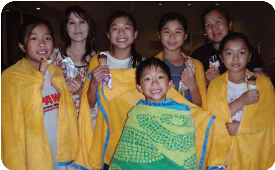
We had a blast at Family Fun Night in July! The winners: the Violet Team! Remember you get more points if you bring friends!