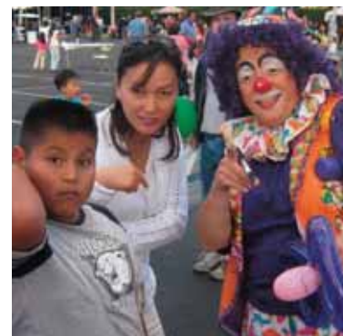
Fest continued from page 1

Sept. 13, 9 AM - 12 NOON, join fellow CC volunteers to canvass our surrounding community, handing out flyers and inviting our neighbors to join us at the Crystal Cathedral on the following Sat., Sept. 20, for a time of family fun, free activities, good food, and great entertainment. Meet at PJ's Café (Welcoming Center) for instructions, etc.