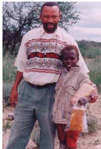
Two friends we met on our last short-term mission trip to Tanzania.