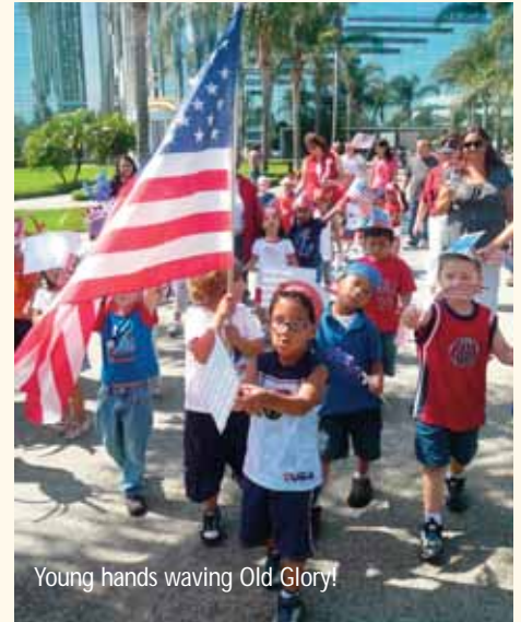
Young hands waving Old Glory!

NOW ENROLLING: Enrollment for the new school year that starts in September is high, but there are still spaces available. Contact the school office at 714-971-4141 for a tour where you'll see for yourself the distinctive program that the preschool has to offer!